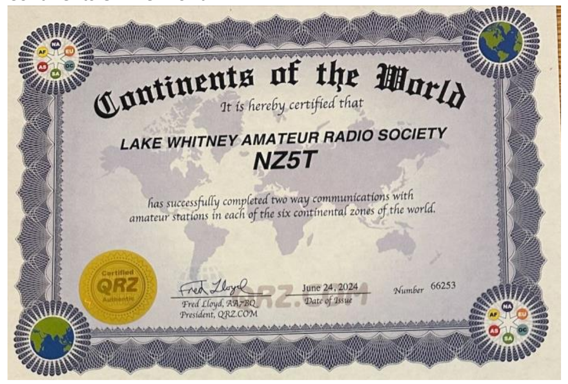
Cont Next Page