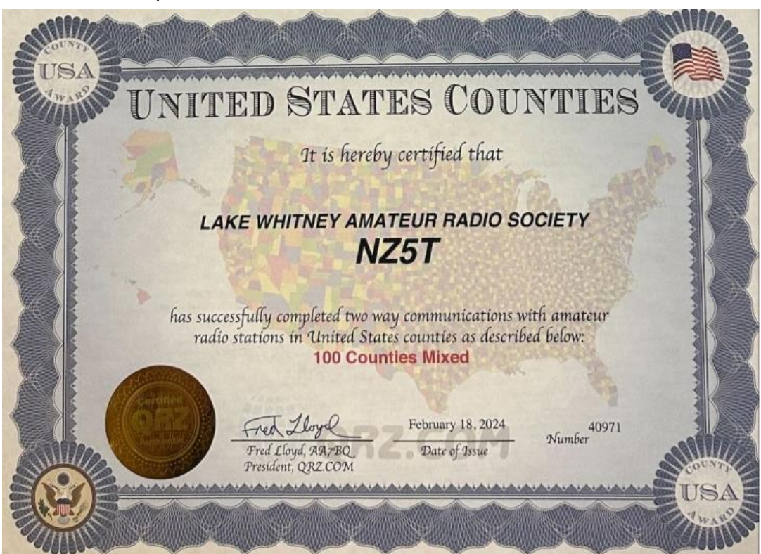
End Of Mins